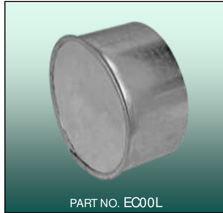
PART NO. EC00L