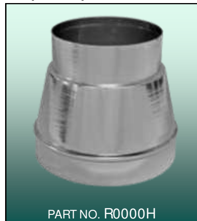
PART NO. R0000H